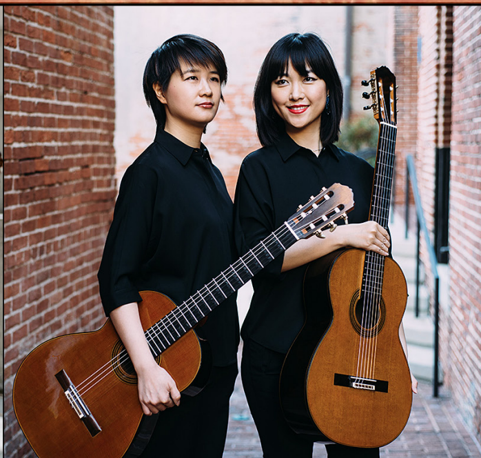
Beijing Guitar Duo: Saturday, November 15, 2025