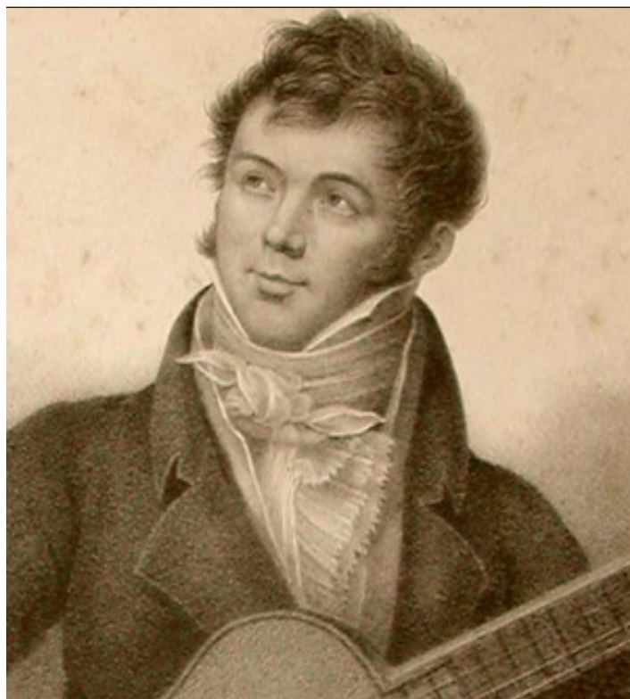
Fernando Sor – (1778-1839)