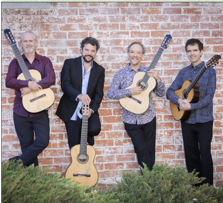
Los Angeles Guitar Quartet: Saturday, April 5th, 2025

All performances take place at the Illsley Ball Nordstrom Recital Hall at Benaroya Hall, 7:30 PM